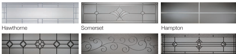
Hawthorne and Somerset shown in platinum leading; also available in brass leading